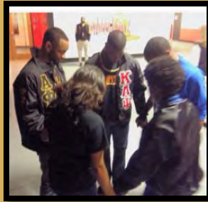
Umd nphc unity stroll

Have a great D9 Thursday today and continue to tweet and Instagram when you see any of your favorite NPHC Geeks around campus.